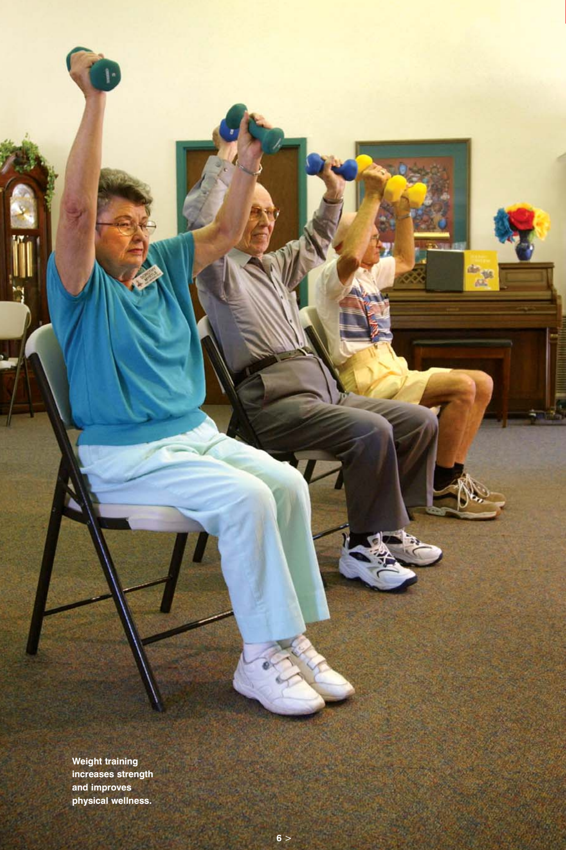
Weight training increases strength and improves physical wellness.