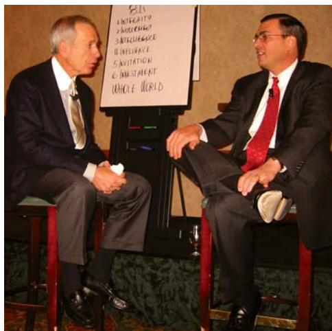
Seminar participants benefitted from a variety of workshop activities.

“ . . . attracting donors has to do with asking people to invest in great causes.”