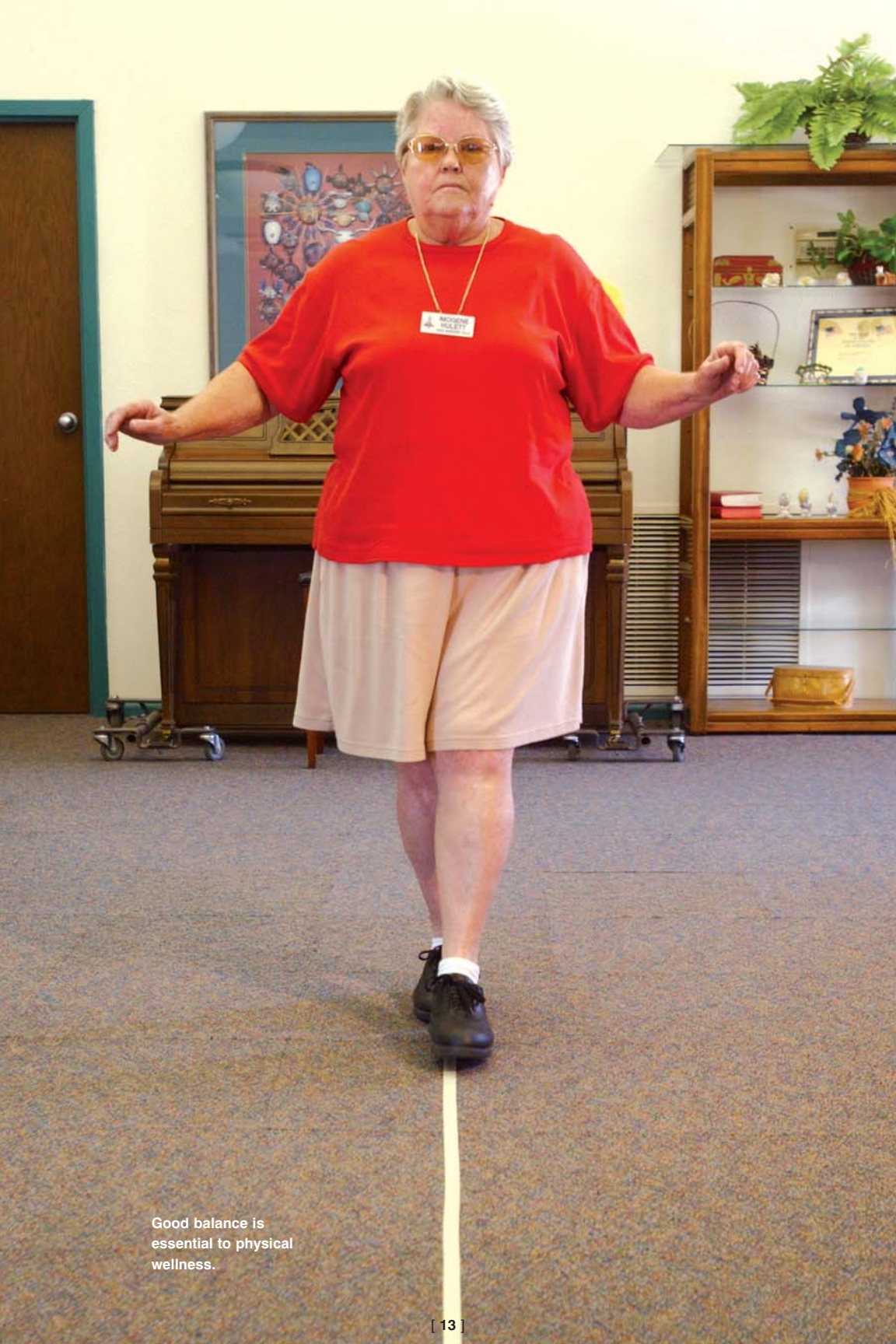
Good balance is essential to physical wellness.