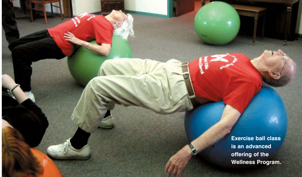
Exercise ball class is an advanced offering of the Wellness Program.

aging: prevention of disease and disability, attainment of peak physical and psychological functioning, and participation in rewarding and productive activities. This program seems to have them all.”