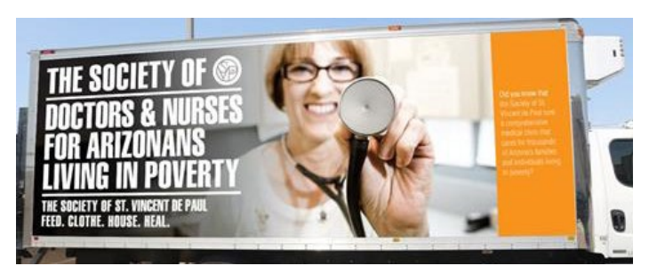
New branding on St. Vincent de Paul's trucks provided more than advertising; it offered a morale boost for staff.

Nonprofits like <u>St. Vincent de Paul</u> are experts in the work they do for the community. But without resources, and without the opportunity to take risks and try new things, they will do good work, but maybe not reach their full potential.